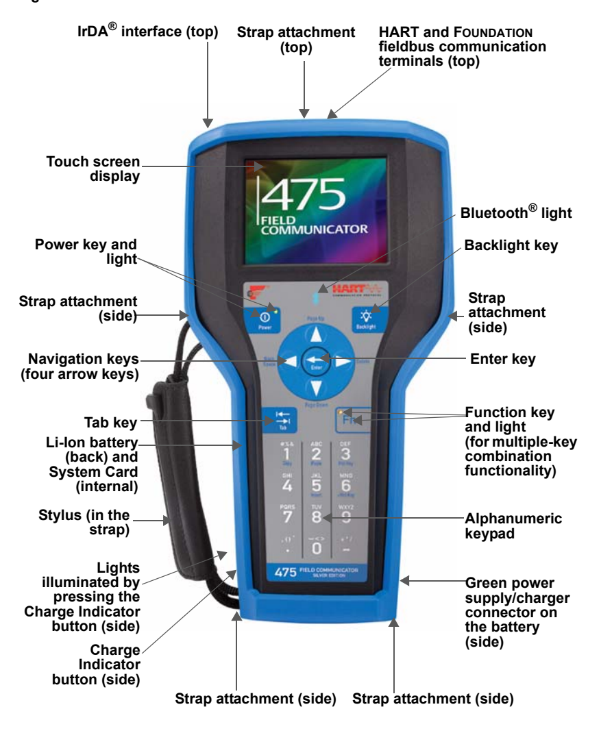
Figure 1. 475 Field Communicator with the Protective Rubber Boot